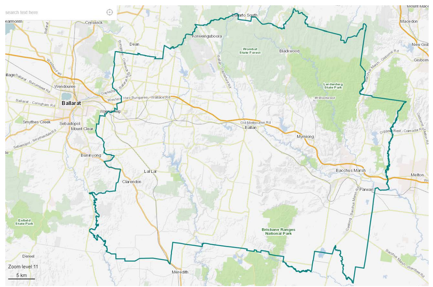
Map 1: Moorabool Shire (blue outline shows municipal boundary)

A stunning shire spanning more than 2,110 square kilometres, Moorabool is made up of 64 localities, hamlets and towns. More than 74% of the Shire comprises of water catchments, state forests and national parks.